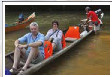
Longhouse Experience – Lemanak (Duration: 2D/1N)