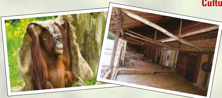
Semenggoh Orang Utan & Land Dayak Longhouse (Duration: 4 – 5 hours)