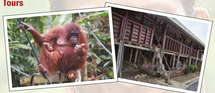
Semenggoh Orang Utan & Mongkos Bidayuh Longhouse (Duration: 2D/1N)