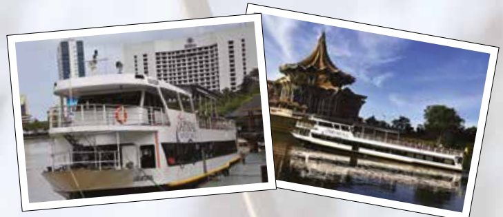
Sarawak River Cruise (Duration: 1.5 hours)