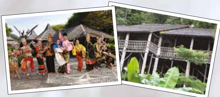
Sarawak Cultural Village (Duration: 4 hours)