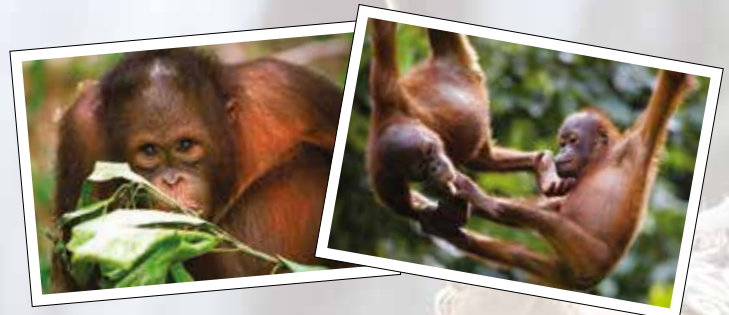
Semenggoh Orang Utan Centre (Duration: 3 hours)