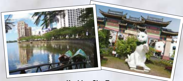
Kuching City Tour (Duration: 3 hours)