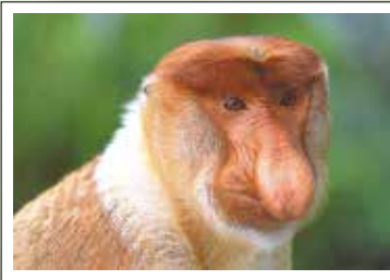
Wetland Cruise & Satang Island (Duration: Day trip)