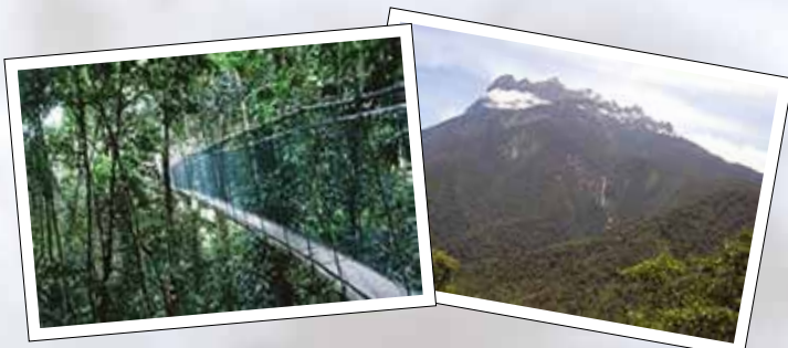
Kota Kinabalu Packages (Duration: 3D/2N or 4D/3N)